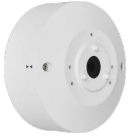
TKH Security JB07/BL Junction box, for BL8xx, BL9x0