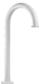
TKH Security WM16 Gooseneck mount, for PD20xx PTZ dome series