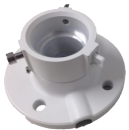
TKH Security CM11 Ceiling mount, for PD20xx-series PTZ cameras