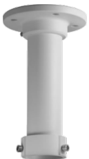
TKH Security CM15 Ceiling mount, for PD20xx-series PTZ cameras, 25cm