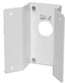
TKH Security WM05 Corner mount, for WM01A, WM27