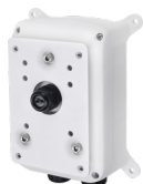
TKH Security JB27 Junction box, for WM01A, WM27