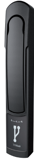
YOUR TANlock 3